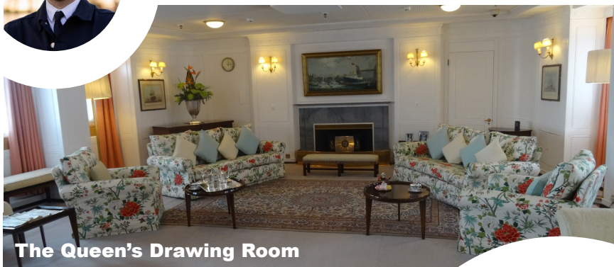
The Queen's Drawing Room

"This evening will be beyond special, and exclusive. Not many people get to experience this, and I'm sure this will be the highlight of the tour for many."