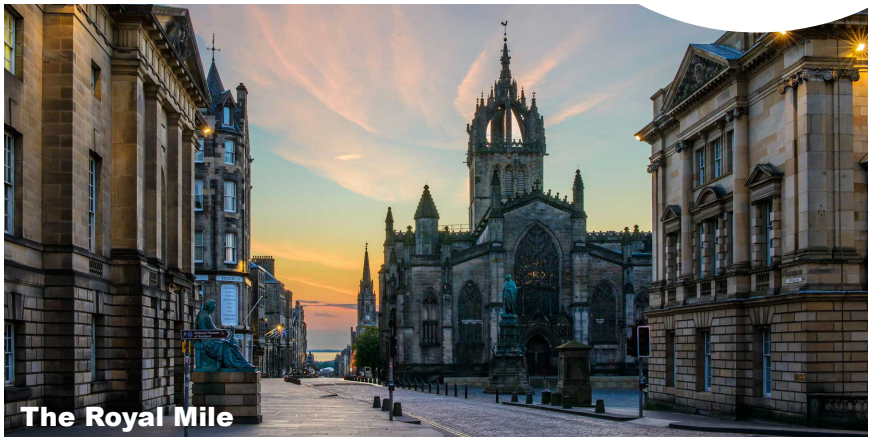
The Royal Mile