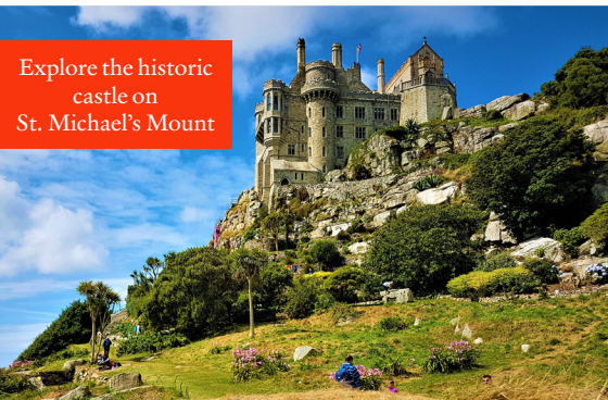
Explore the historic castle on St. Michael's Mount