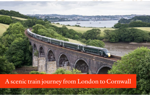
A scenic train journey from London to Cornwall

* Due to AM train departures from London, we HIGHLY recommend that guests arrive to London prior to the first day of the tour.