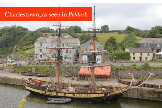
Charlestown, as seen in Poldark

Today after a delicious seaside breakfast, we will head to the gorgeous hidden gem of Fowey, filled with cobblestone streets, unique shops, architectural delights and charm. We will begin by hearing about the history of Fowey, and then you'll have some time to explore the village, do some shopping, sit along the picturesque waterfront or go into some of the village's historical buildings.