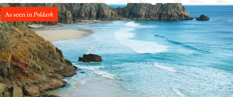
As seen in Poldark

The drive between the Botallack Mines and St. Ives is truly one you won't forget for its rugged beauty and stunning vistas. St. Ives will be our home for the next two nights. This stunning seaside community is known for a vibrant arts scene and unique attractions. Our accommodations in St. Ives will be the luxurious Pedn Olva Hotel, frequently rated as one of the best boutique hotels in Britain.