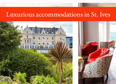
Luxurious accommodations in St. Ives